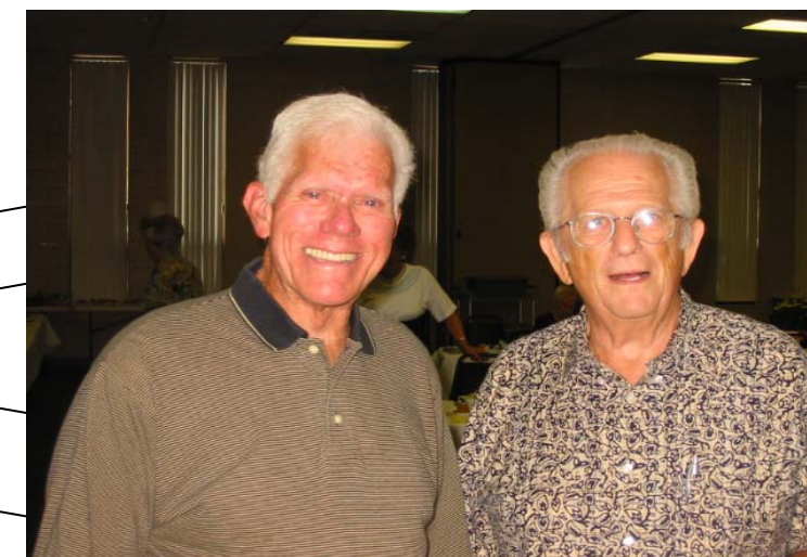
REAL MEN LOVE JESUS